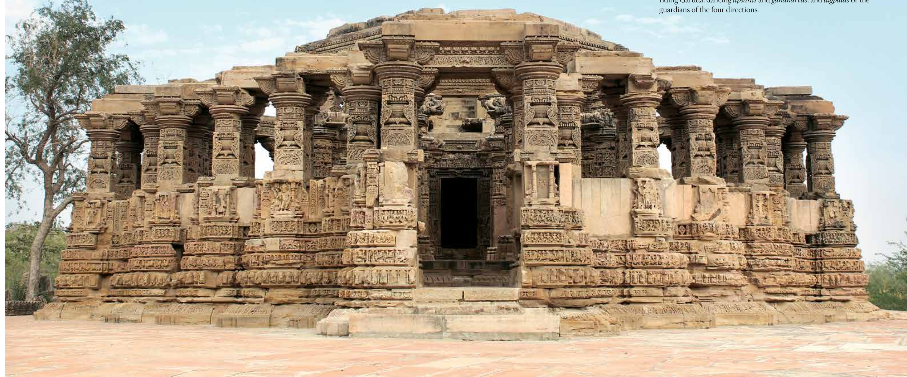
Five pillars on either side of the entrance framing the doorway of the Someshwar Temple, Kiradu, Rajasthan

Reminiscent of the Maru-Pratihara style of architecture, the temples comprise elements such as elaborate sanctums and myriad sculptures that depict everyday life, temple-building scenes, erotica and mythological incidents. The Vishnu temple consists of an octagonal rangamandapa or dancing hall that is bordered by eight pillars. The sculptures in this temple include those of Lord Vishnu riding Garuda, dancing apsaras and gandharvas , and digpalas or the guardians of the four directions